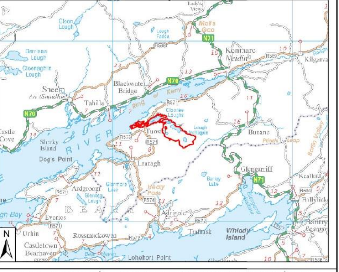
Suirbhéireacht Ordanáis Éireann Ceadúnas Uimhir OSI-NMA-014 Ordanace Survey Ireland Licence No. OSI-NMA-014 Córas Comhordanáidí: Trasteilgean Mercator na hÉireann / Co-ordinate System: Irish Transverse Mercator

Leagan / Version: 3.02 Arna chló an / Printed on: 03/11/2022