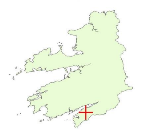
Co. Chiarraí Co. Kerry