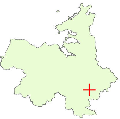
Co. Shligigh / Co. Sligo