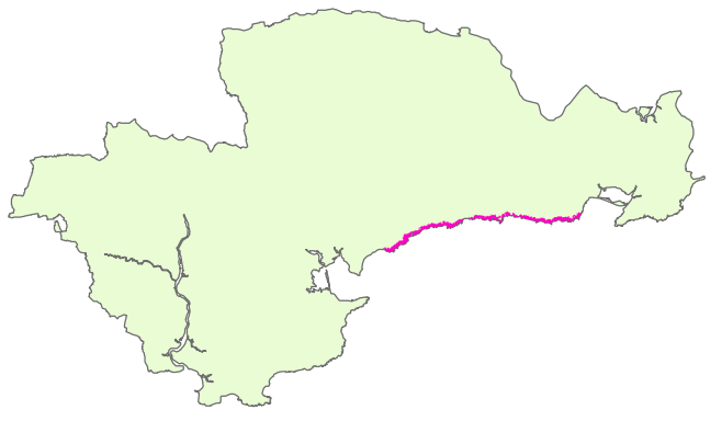
CO. WATERFORD CO. PHORT LÁIRGE