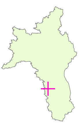
CO. ROSCOMMON CO. ROSCOMÁIN