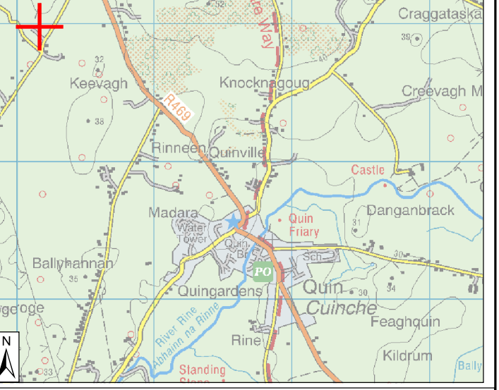
Suirbhéireacht Ordanáis Éireann Ceadúnas Uimhir EN 0059216 © OSi / Rialtas na hÉireann Ordnance Survey Ireland Licence No. EN 0059216 © Ordnance Survey Ireland / Government of Ireland Córas Comhordanáidi: Trasteilgean Mercator na hÉireann / Co-ordinate System: Irish Transverse Mercator