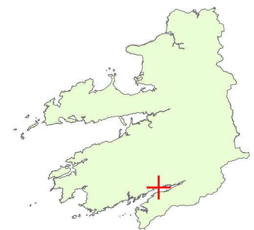
Co. Chiarraí / Co. Kerry