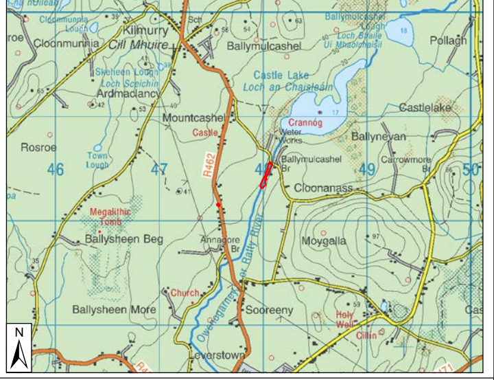
Suirbhéireacht Ordanáis Éireann Ceadúnas Uimhir EN 0059214 Ordnance Survey Ireland Licence No. EN 0059214 Córas Comhordanáidí: Trasteilgean Mercator na hÉireann / Co-ordinate System: Irish Transverse Mercator