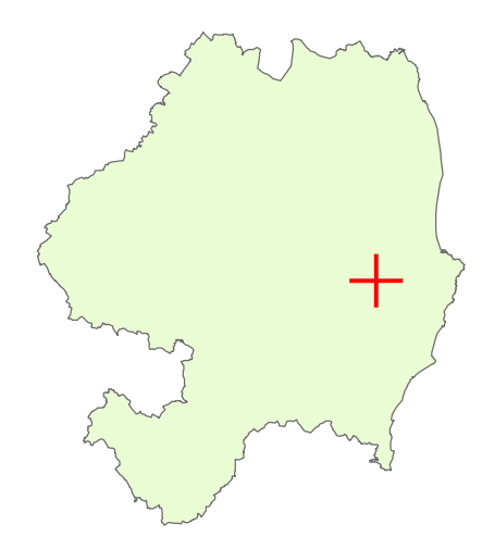
Co. Chill Mhantáin Co. Wicklow