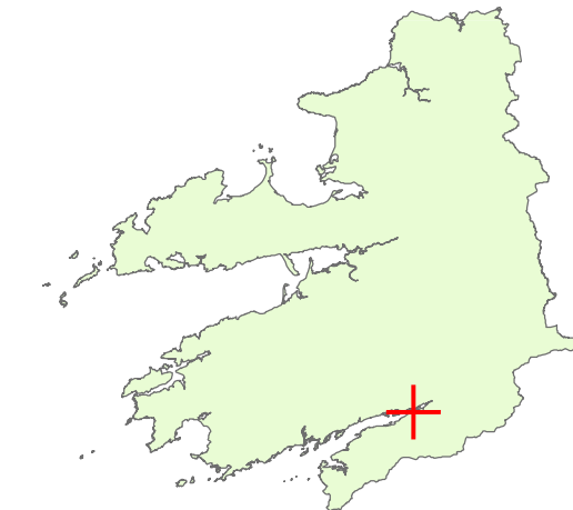
Co. Chiarraí Co. Kerry

LCS Choill Mhucshnámha Mucksna Wood SAC 001371 Achar / Area 14.07 ha