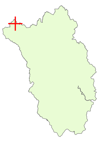
Co. Chill Chainnigh Co. Kilkenny