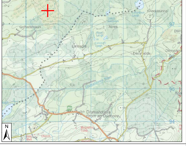
Suirbhéireacht Ordanáis Éireann Ceadúnas Uimhir EN 0059216 © OSi / Rialtas na hÉireann Ordnance Survey Ireland Licence No. EN 0059216 © Ordnance Survey Ireland / Government of Ireland Córas Comhordanáidí: Trasteilgean Mercator na hÉireann / Co-ordinate System: Irish Transverse Mercator