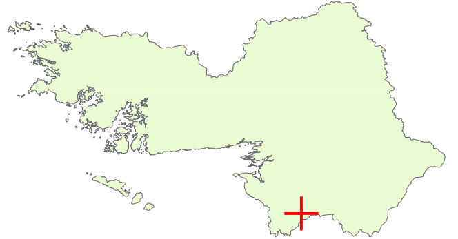
Co. na Gaillimhe Co. Galway