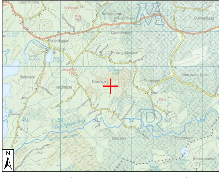
Suirbhéireacht Ordanáis Éireann Ceadúnas Uimhir EN 0059216 Ordnance Survey Ireland Licence No. EN 0059216 Córas Comhordanáidí: Trasteilgean Mercator na hÉireann / Co-ordinate System: Irish Transverse Mercator