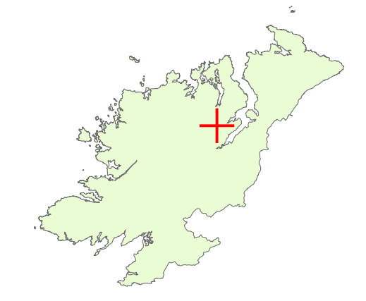
Co. Dhún na nGall Co. Donegal