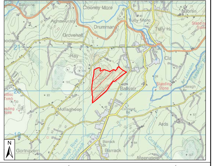
Suirbhéireacht Ordanáis Éireann Ceadúnas Uimhir EN 0059216 © OSi / Rialtas na hÉireann Ordnance Survey Ireland Licence No. EN 0059216 © Ordnance Survey Ireland / Government of Ireland Córas Comhordanáidí: Trasteilgean Mercator na hÉireann / Co-ordinate System: Irish Transverse Mercator