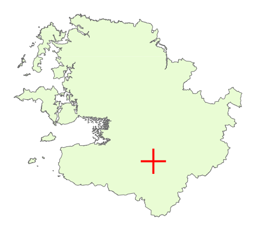
Co. Mhaigh Eo Co. Mayo