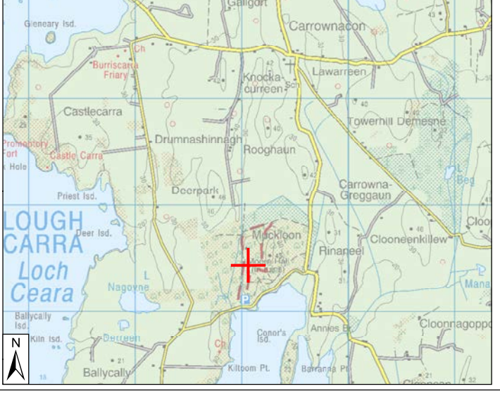
Suirbhéireacht Ordanáis Éireann Ceadúnas Uimhir EN 0059216 Ordnance Survey Ireland Licence No. EN 0059216 Córas Comhordanáidí: Trasteilgean Mercator na hÉireann / Co-ordinate System: Irish Transverse Mercator