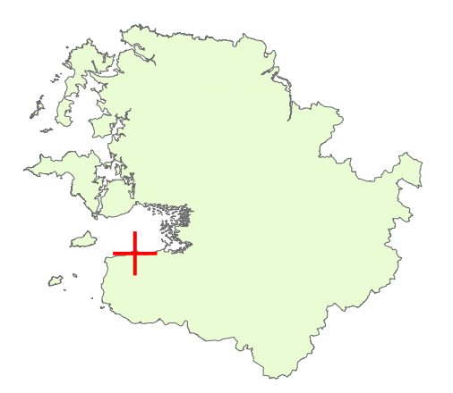
Co. Mhaigh Eo Co. Mayo