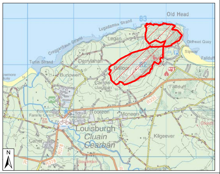
Suirbhéireacht Ordanáis Éireann Ceadúnas Uimhir EN 0059216 © OSi / Rialtas na hÉireann Ordnance Survey Ireland Licence No. EN 0059216 © Ordnance Survey Ireland / Government of Ireland Córas Comhordanáidí: Trasteilgean Mercator na hÉireann / Co-ordinate System: Irish Transverse Mercator