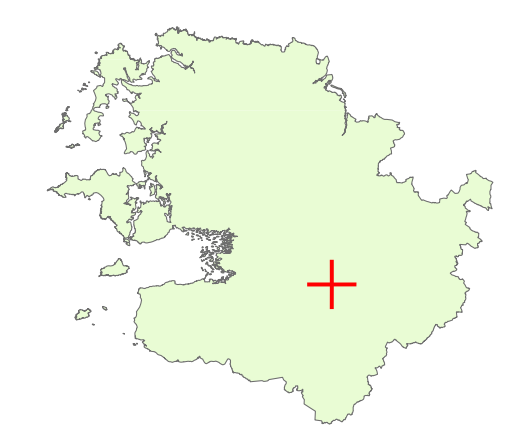
Co. Mhaigh Eo Co. Mayo