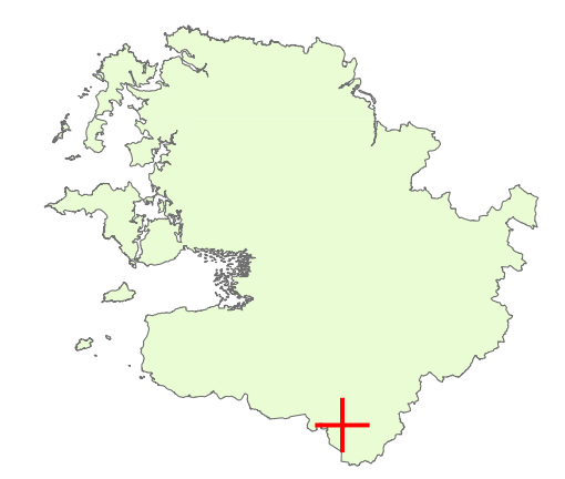
Co. Mhaigh Eo Co. Mayo