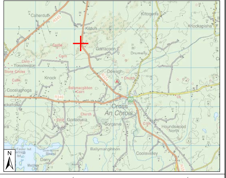
Suirbhéireacht Ordanáis Éireann Ceadúnas Uimhir EN 0059216 Ordnance Survey Ireland Licence No. EN 0059216 Córas Comhordanáidí: Trasteilgean Mercator na hÉireann / Co-ordinate System: Irish Transverse Mercator