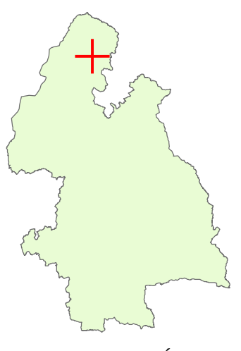
Co. Thiobraid Árann Co. Tipperary