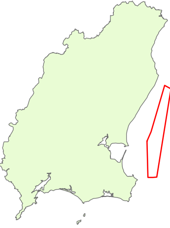
Co. Loch Garman / Co. Wexford