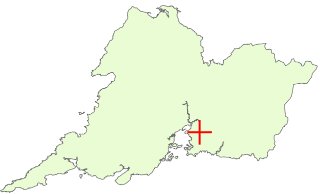
Co. an Chláir Co. Clare