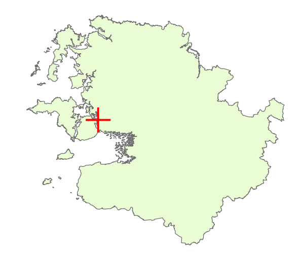
Co. Mhaigh Eo Co. Mayo