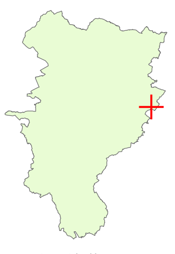
Co. Chill Dara Co. Kildare