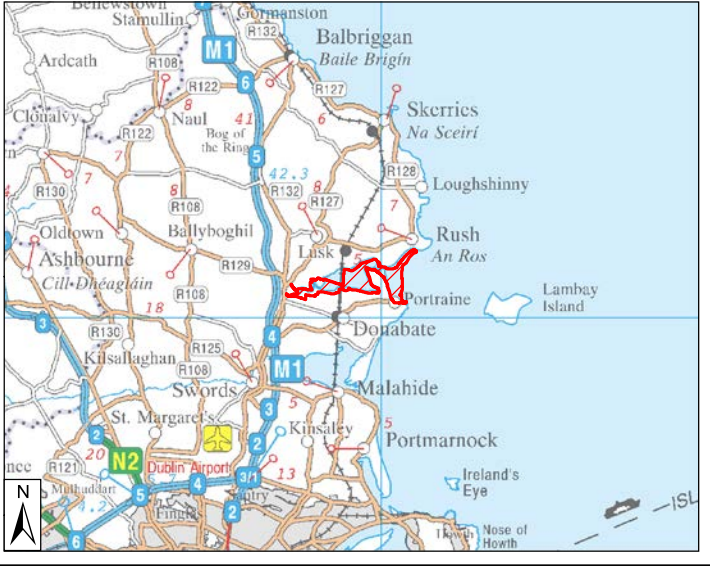
Suirbhéireacht Ordanáis Éireann Ceadúnas Uimhir EN 0059216 Ordnance Survey Ireland Licence No. EN 0059216 Córas Comhordanáidí: Trasteilgean Mercator na hÉireann / Co-ordinate System: Irish Transverse Mercator