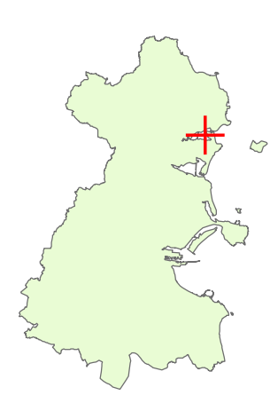
Co. Bhaile Átha Cliath Co. Dublin