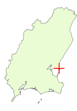
Co. Loch Garman Co. Wexford